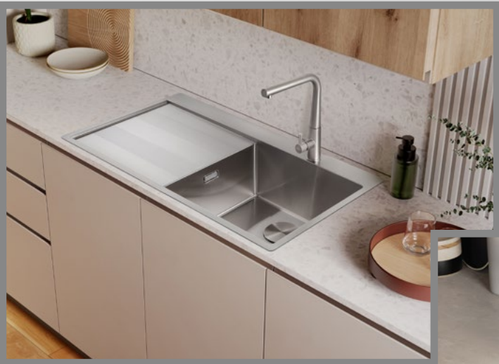
Cosmo pg. 7