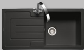
1000 x 500mm 1 bowl sink with reversible drainer CAU10101MB/

Min. base unit: 600mm Main bowl (L x W x D): 449 x 415 x 190mm Waste kit: Included