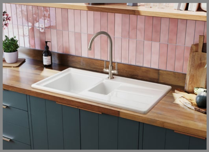
Arlington Ceramic pg. 28