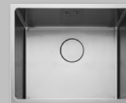
540 x 440mm 1 bowl sink CBX50/

Min. base unit: 600mm Main bowl (L x W x D): 500 x 400 x 200mm Waste kit: Included