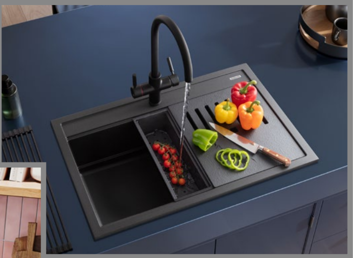
Prato pg. 19