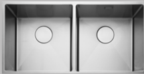
860 x 440mm 2 bowl sink KUBE4040/

Min. base unit: 900mm Main bowl (L x W x D): 400 x 400 x 200mm Second bowl (L x W x D): 400 x 400 x 200mm Waste kit: Included