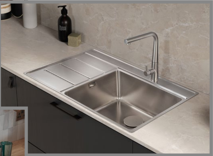
Boston pg. 8