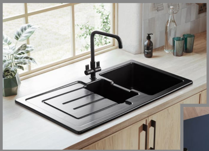
Austell Matt Black pg. 27