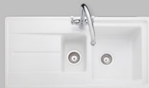
985 x 500mm 1.5 bowl sink with reversible drainer CAR1052WH/

Min. base unit: 600mm Main bowl (L x W x D): 334 x 375 x 195mm Second bowl (L x W x D): 172 x 260 x 145mm Waste kit: Included