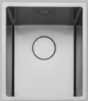
380 x 440mm 1 bowl sink KUBE34/

Min. base unit: 450mm Main bowl (L x W x D): 340 x 400 x 200mm Waste kit: Included