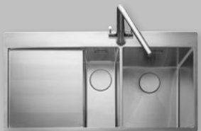
960 x 500mm 1.5 bowl sink with handed drainer CSM9602L/ - Left-hand drainer | CSM9602R/ - Right-hand drainer

Min. base unit: 600mm Main bowl (L x W x D): 350 x 400 x 200mm Second bowl (L x W x D): 180 x 400 x 140mm Waste kit: Included