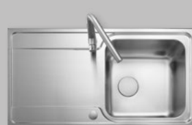
950 x 508mm 1 bowl sink with reversible drainer ICN9501/

Min. base unit: 600mm Main bowl (L x W x D): 400 x 400 x 205mm Waste kit: Included