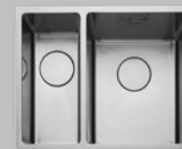
560 x 440mm 1.5 bowl sink CBX3218L/ - Left-hand CBX3218R/ - Right-hand

Min. base unit: 800mm Main bowl (L x W x D): 700 x 400 x 200mm Waste kit: Included