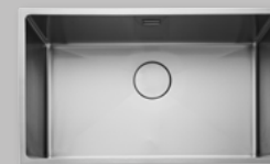
740 x 440mm 1 bowl sink CBX70/

Min. base unit: 800mm Main bowl (L x W x D): 700 x 400 x 200mm Waste kit: Included