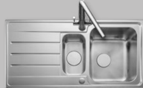
1000 x 500mm 1.5 bowl sink with reversible drainer OAK1052/

Min. base unit: 600mm Main bowl (L x W x D): 340 x 400 x 205mm Second bowl (L x W x D): 170 x 300 x 135mm Waste kit: Included