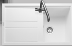
Arctic White (AW)