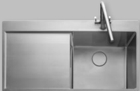
960 x 500mm 1 bowl sink with handed drainer CSM9601L/ - Left-hand drainer | CSM9601R/ - Right-hand drainer

Min. base unit: 600mm Main bowl (L x W x D): 460 x 400 x 210mm Waste kit: Included