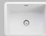
557 x 430mm 1 bowl sink CRUB4936WH/

Min. base unit: 600mm Main bowl (L x W x D): 494 x 367 x 194mm Waste kit: Included