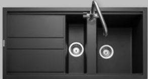
1000 x 510mm 1.5 bowl sink TOP1002___/

Min. base unit: 600mm Main bowl (L x W x D): 319 x 421 x 200mm Second bowl (L x W x D): 150 x 421 x 140mm Waste kit: Included