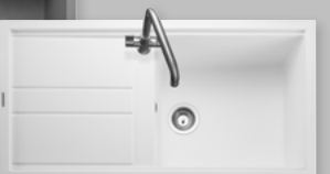
Arctic White (AW)