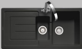
1000 x 500mm 1.5 bowl sink with reversible drainer CAU10102MB/

Min. base unit: 600mm Main bowl (L x W x D): 340 x 415 x 190mm Second bowl (L x W x D): 170 x 300 x 142mm Waste kit: Included