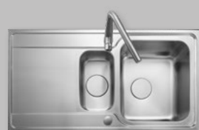
950 x 508mm 1.5 bowl sink with reversible drainer ICN9502/

Min. base unit: 600mm Main bowl (L x W x D): 340 x 400 x 200mm Second bowl (L x W x D): 170 x 300 x 130mm Waste kit: Included