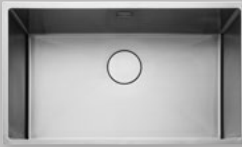
740 x 440mm 1 bowl sink KUBE70/

Min. base unit: 800mm Main bowl (L x W x D): 700 x 400 x 200mm Waste kit: Included