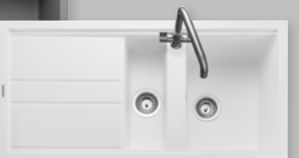
Arctic White (AW)