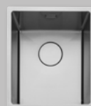
460 x 440mm 1 bowl sink CBX42/

Min. base unit: 500mm Main bowl (L x W x D): 420 x 400 x 200mm Waste kit: Included