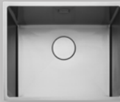
540 x 440mm 1 bowl sink KUBE50/

Min. base unit: 600mm Main bowl (L x W x D): 500 x 400 x 200mm Waste kit: Included